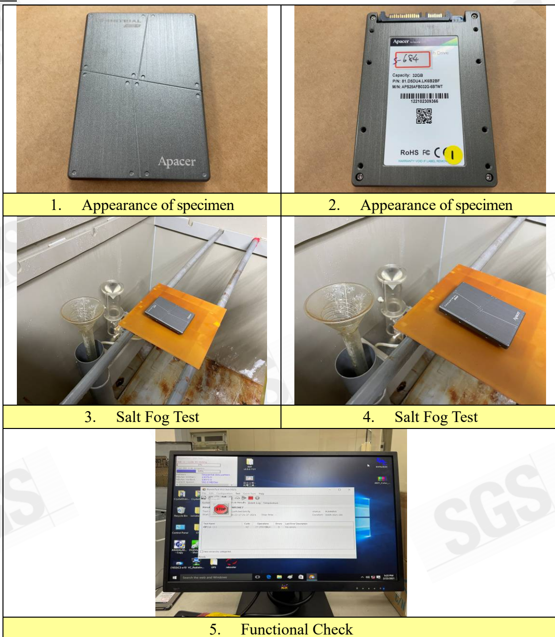
1. Appearance of specimen